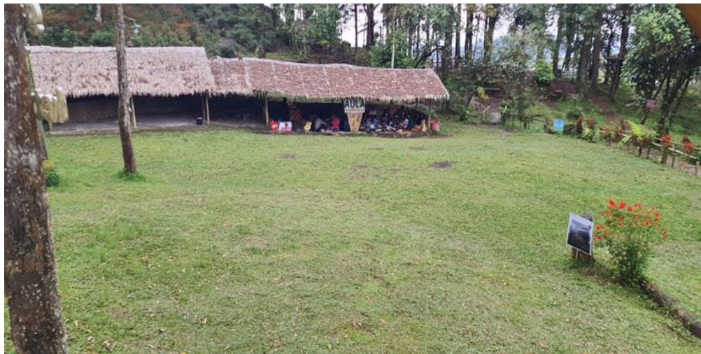
Fig. 7. Clean environment at Puncak Tangke Tabu