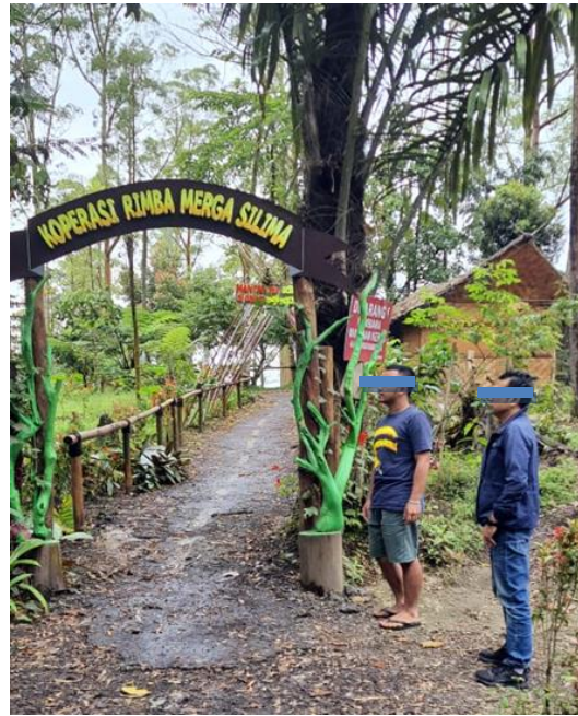
Fig. 6. Rimba Merga Silima cooperative team