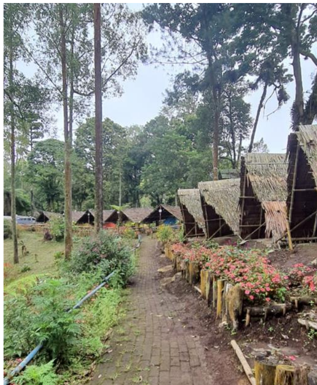
Fig. 5. Resting huts at Puncak Tangke Tabu