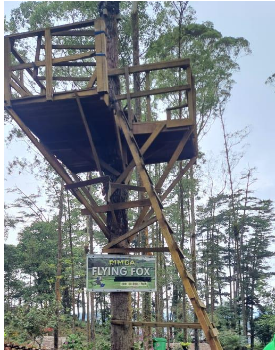
Fig. 2. Flying fox attraction at Puncak Tangke Tabu