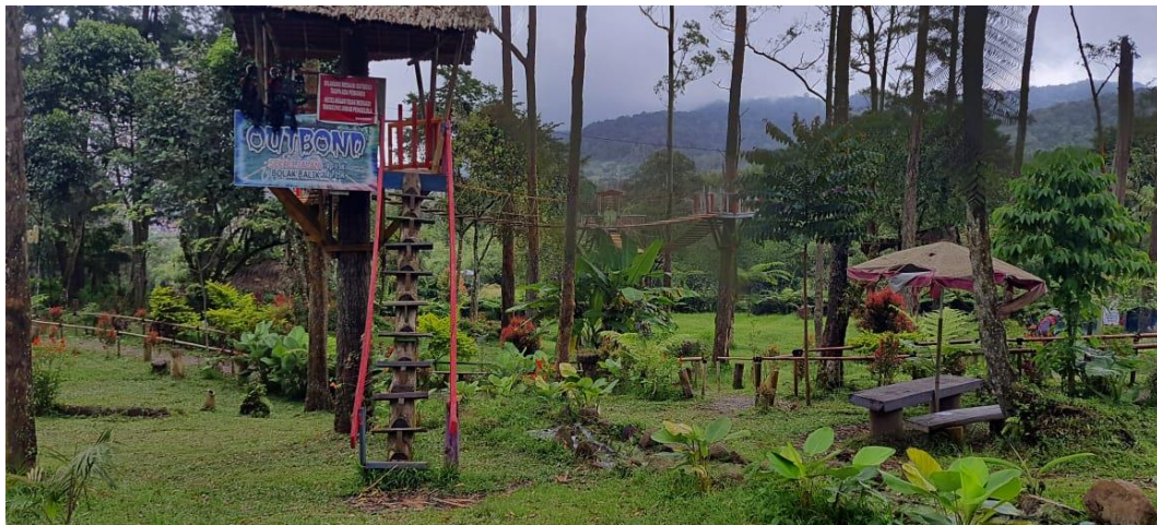
Fig. 3. Outbound activities at Puncak Tangke Tabu