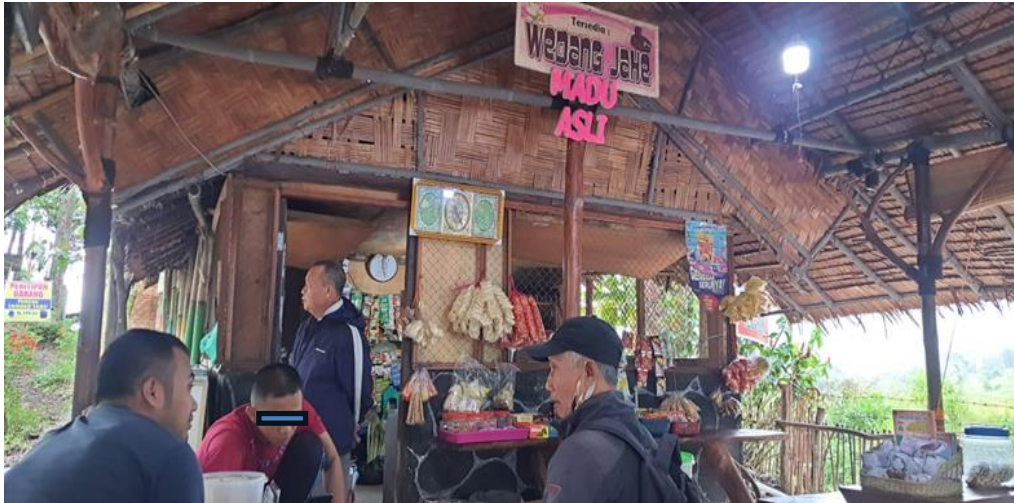
Fig. 4. Food Stall at Puncak Tangke Tabu

Amenity: Current amenities include food stalls, prayer facilities, and clean toilets. Opportunities for development include the addition of souvenir shops, healthcare clinics, and accommodation options tailored to elderly visitors.